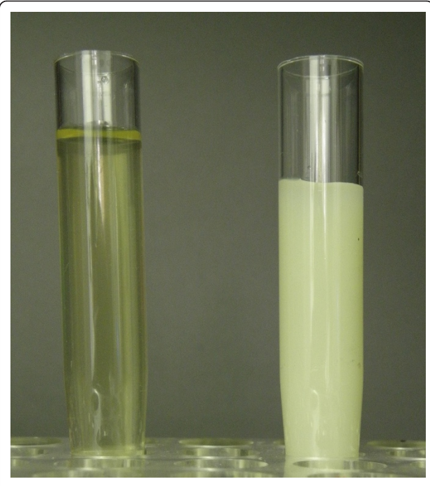
Figure 1 Macroscopic appearance of an over-night fasting urine sample (left); postprandial urine sample 2 hours after breakfast (right).

Magnetic resonance imaging revealed bilateral ovary cysts and a right-sided lymphmalformation (Figure 2). The exact location of the lymphorenal/lymphoureteral