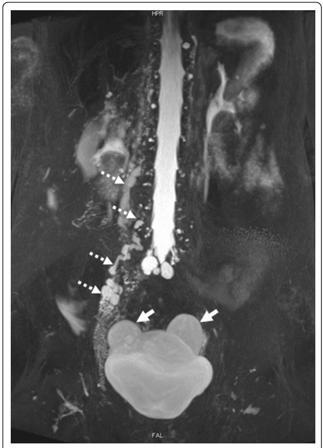
Figure 2 Magnetic resonance imaging (T2 weighted HASTE sequence) showing bilateral ovary cysts (solid arrows) and a right-sided paravertebral lymphmalformation (dashed arrows).