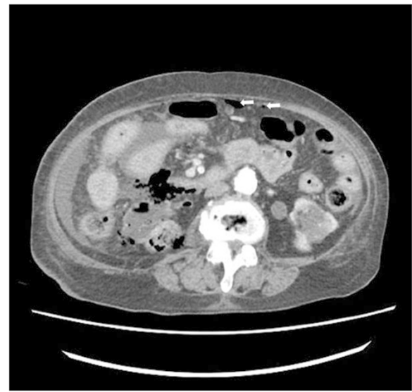
Fig. 1 Abdominal CT finding. Axial view showing gas in the right renal parenchyma and perirenal space and intraperitoneal air (arrows)

surgery, the patient was admitted to the intensive care unit for postoperative management. Norepinephrine was administered to maintain the blood pressure, and was tapered on postoperative day 2. The patient was weaned from ventilator support and extubated on postoperative day 4. Follow-up CT performed 10 days after the initial study showed fluid collection and hematoma at the nephrectomy site. Hence, percutaneous drainage was performed. Another follow-up CT after 3 weeks indicated that the fluid collection at the nephrectomy site had nearly disappeared. The patient was discharged to home in a stable condition, and was advised to attend follow-up visits at the surgery and nephrology departments.