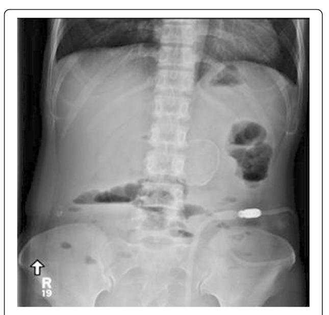
Fig. 1 Plain abdominal radiography, upright view, showing several air-fluid levels

She presented with a history of nausea, vomiting and abdominal pain, with report of not having had flatus or bowel movements for a few days.