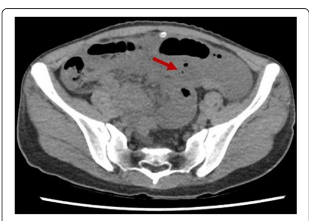
Fig. 2 CT abdomen showing dilated bowel loops with transition point (arrow) in pelvis

Her past medical history included a diagnosis of antiphospholipid antibody syndrome (APLAS) on anticoagulation, end-stage kidney disease, multiple previous arterial and venous thrombotic events, congestive heart failure, previous mitral valve replacement, atrial fibrillation, hepatitis C, and hypothyroidism. She had been started on PD in the form of continuous ambulatory PD (CAPD) 5 years prior to the current presentation. As with the first patient, there had been no peritonitis during her 5-year course of PD. There was no history of bowel surgery or bowel obstruction. On initial 4-h PET, D/P Cr was 0.78 (high-average transporter).