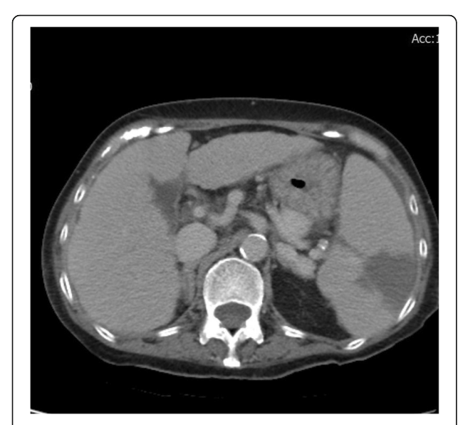
Fig. 4 Computed tomography of the abdomen, revealing a splenic infarction

discharged the patient with a long-term prescription of fluconazole 200 mg/d. The patient died from hepatic encephalopathy and coma on September 26, 2015.