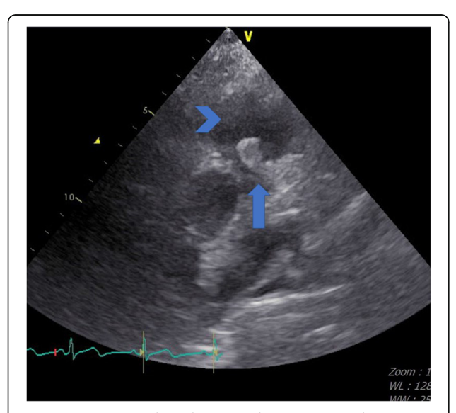
Fig. 1 Vegetation on the pulmonary valve (arrow) near the pulmonary artery (arrowhead) on August 21, 2015. The size of vegetation was 1.2 cm

No other vegetation was found. Surgical intervention was suggested, but the family of the patient declined because of her multiple comorbidities. Therefore, amphotericin B 40 mg was administered once daily from August 30 but was discontinued on September 1 because of allergic reactions (rash and fever). After 8 weeks of caspofungin, the C. guilliermondii septicemia was still present and the vegetation on the pulmonary valve had increased in size (3.73 \times 2.70 \text{ cm}) . Computed tomography (CT) of the chest and abdomen revealed splenic infarction and right upper lung pneumonia with septic embolism (Figs. 3 and 4). The patient and family requested hospice care, and we