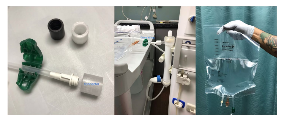
Fig. 1 Trial phase of on-site CKRT dialysate production system. During the testing phase in July 2020, we procured prototypes of 3-D printed biocompatible connectors ( A ) from a local contractor. Using these connectors along with the IHD machines, dialyzers, and hemodialysis concentrate ( B ) that we typically use in our adult inpatient dialysis program and sterile bags normally utilized for parenteral nutrition ( C ), we generated bags of CKRT dialysate to both trial the system and to perform testing for fluid composition and microbiologic contamination. Abbreviations: CKRT, continuous kidney replacement therapy; IHD, intermittent hemodialysis

mean ± standard deviation whereas those that are not normally distributed are presented as median [interquartile range]. Categorical variables are presented as frequencies and proportions. Data compilation and statistical analyses were performed using Excel (Microsoft, Redmond, WA) and R version 4.2.2 (R Foundation for Statistical Computing, Vienna, Austria).