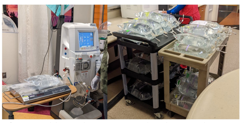
Fig. 3 Implementation phase of on-site CKRT dialysate production system. During the implementation phase in December 2021 and January 2022, every morning our hemodialysis staff utilized two IHD machines in our pediatric hemodialysis unit to generate bags of CKRT dialysate ( A ). We developed a process for distributing the bags throughout our adult ICUs and a labeling system using colored tape and stickers to assist in tracking our inventory and to allow us to track the production date and time and the IHD machine of origin for every bag of dialysate produced ( B ). Photos were cropped for staff anonymity. Abbreviations: CKRT, continuous kidney replacement therapy; ICU, intensive care unit; IHD, intermittent hemodialysis

We describe the successful emergency implementation of an on-site CKRT dialysate production system in response to the unexpected disruption of our supply of premanufactured CKRT solutions during the COVID-19 pandemic. The keys to successful execution of this system included the foresight to develop a backup plan early in the pandemic, the flexibility of our acute dialysis program to shift manpower to the task of generating