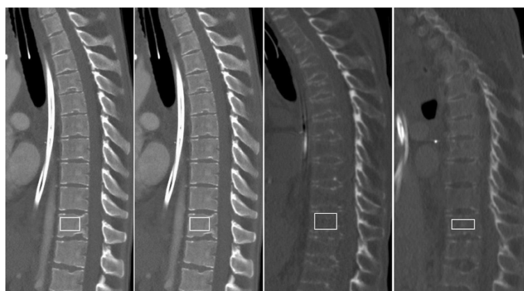
Figure 2 Sagittal plain computed tomographic imaging of the vertebral column over time. Computed tomographic imaging from four different time points are shown. Region of interest within the thoracolumbar vertebral body is marked with a white square. Corresponding Hounsfield Units (HU) at 3 years prior admission (242 HU), admission (238 HU), day 95 of CVVHD (52 HU), and day 226 of CVVHD (90 HU) are labelled accordingly. Three years prior to admission bone mineral density (BMD) was within physiological limits with age-adjusted configuration within normal limits for the thoracolumbar vertebrae. No significant change was found at admission. A significant decrease in BMD was noted at 4.5 months after admission (day 95 of CVVHD), with radiodensity decreasing to 52 HU preventing differentiation between the vertebral body edge and the spinal canal. BMD increased to 90 HU after intervention.