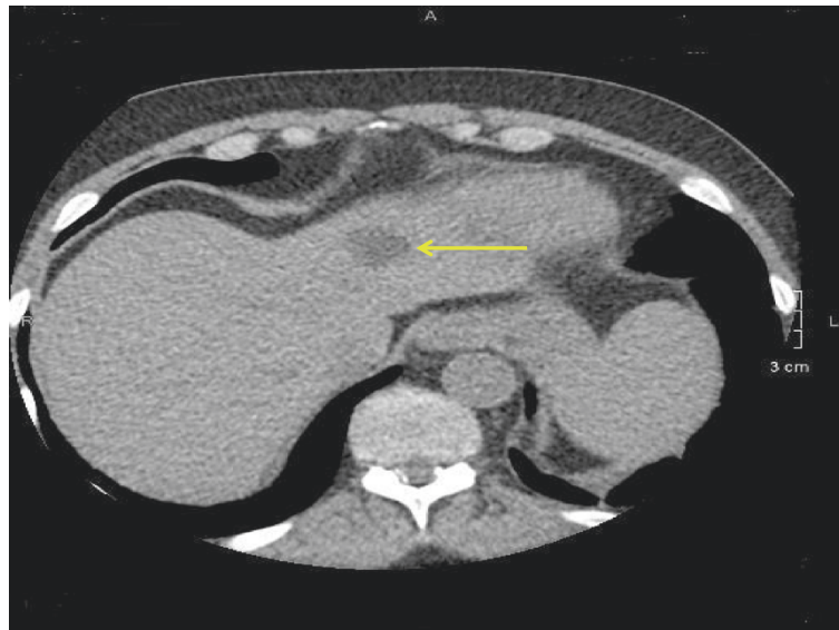
Figure 3 A left liver lobe lobulated hypodense lesion 2.2 × 1.9 cm.