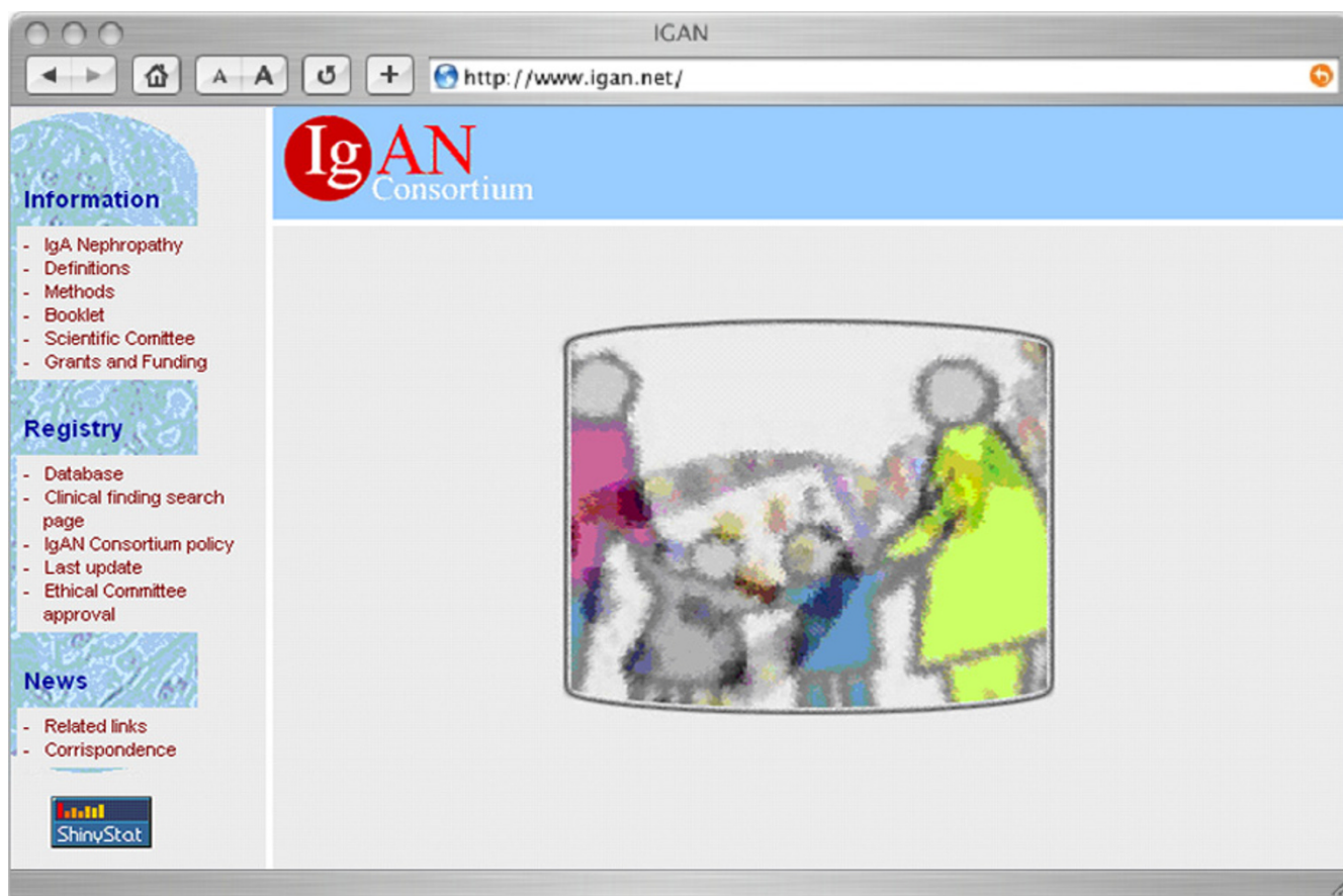
Figure 1 IgAN Consortium website structure.

The main aim of the project was to constitute a genomic DNA bank of well characterized IgAN patients and their relatives from three different European countries (Germany, Greece and Italy) to be used for genetic studies. The following objectives were reached: