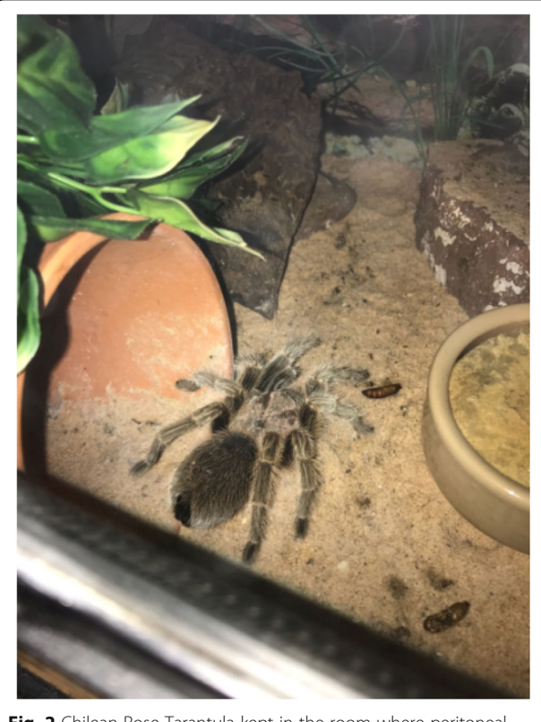
Fig. 2 Chilean Rose Tarantula kept in the room where peritoneal dialysis exchanges occurred

Given our patients preserved urine output, he was able to remain off renal replacement therapy for two months following completion of the Amphotericin course. The patient was pleased that dialysis could be held, and peritoneal dialysis recommenced now a source had been identified, as he wished to avoid haemodialysis. A further Tenchkoff catheter was inserted and dialysis resumed. In the interim, the cases housing the tarantulas and bearded dragon were moved to another area of the house, and a thorough deep clean of his room completed.